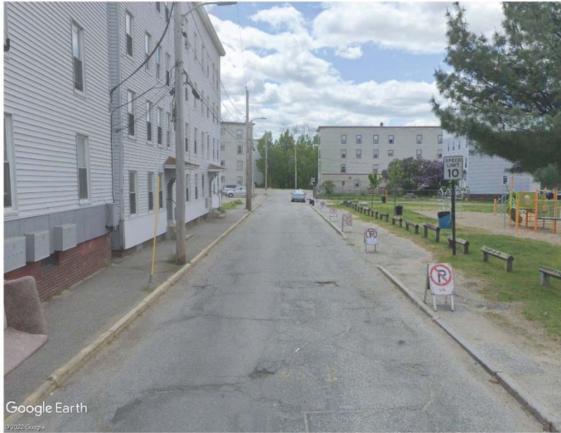
New Parking Stall Location